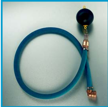
3P Floating Intake Art No. 4000620 Float Ball at 15cm Diameter Filter Inlet Check Valve - 1" 2m suction Pipe Other fittings available

3P Floating Intakes - Enables abstraction of the cleanest rainwater from the storage tank