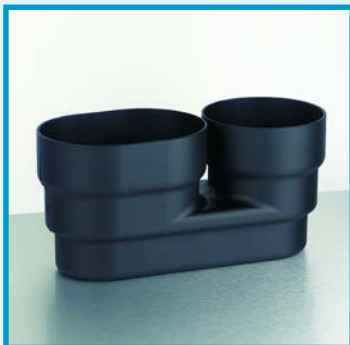
3P Calmed Inlet 125mm/110mm Art No. 4000100 Prevents disturbance of settled sedimentation layer.