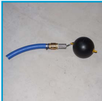
3P Floating Intake 30cm Art No. Float Ball Diameter 15cm Filter Inlet sleeve mesh Check Valve - 1" 30cm suction Pipe Range of connections available