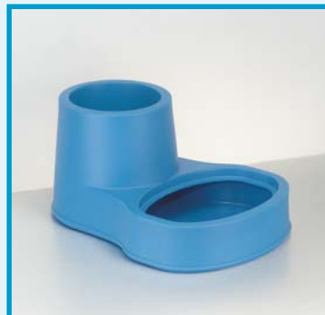
3P Giant Calmed Inlet 150mm/250mm Art No. Prevents disturbance of settled sedimentation layer in large tanks.