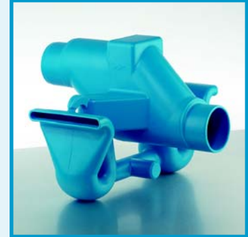
3P Overflow Siphon Duo Art No. 4000200 The 3P Overflow Siphon Duo is installed inside the rainwater tank - between the filter and the tank wall overflow outlet.