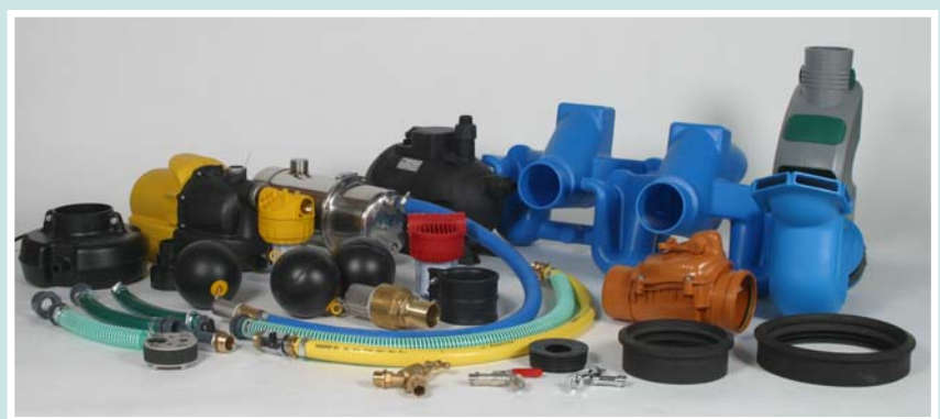
There are a wide range of fixtures and fittings available 3P can make up bespoke fittings if ordered in bulk