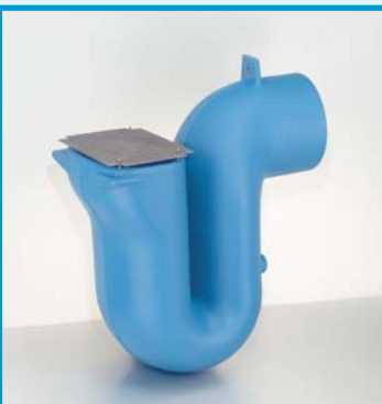
3P Giant Overflow Siphon DN250-150 With Rodent Barrier Art No. 4000220