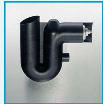
3P Overflow Siphon DN100-Spiral Rodent Barrier Art No. 4000310 Basic overflow with premium rodent barrier.