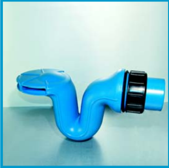
3P Overflow Siphon Uno Art No. 4000260 With screw threaded union connector - ideal for installation through plastic tank wall.

3P Overflow Siphons - Adequate overflow is essential for optimum tank water quality- Inadequate overflow is the primary cause of odour in failed rainwater systems.