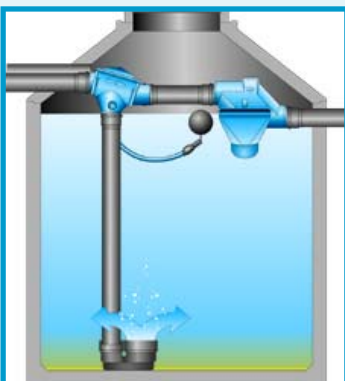
3P Filter, Calmed Inlet, Overflow Siphon and Floating Intake utilised inside a Rainwater Tank.