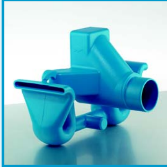
3P Overflow Siphon Mono Art No. 4000250 With rodent and odour barrier - with skimming effect on tank water surface utilising chamfered inlet slots.