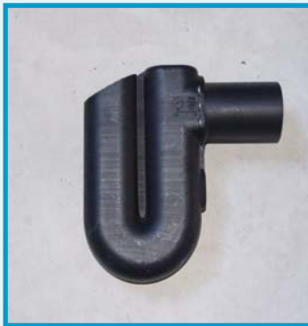
3P Overflow Siphon DN100-Steel Bars Rodent Barrier Art No. 4000215 Basic overflow with steel bars to keep out rodents.