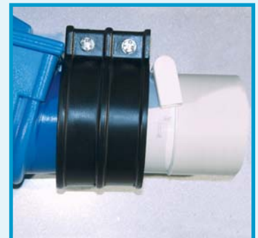
3P Rapid Connector Art No. 1000210 Enables connection of plain ended 110mm pipe. Useful in tank turrets.