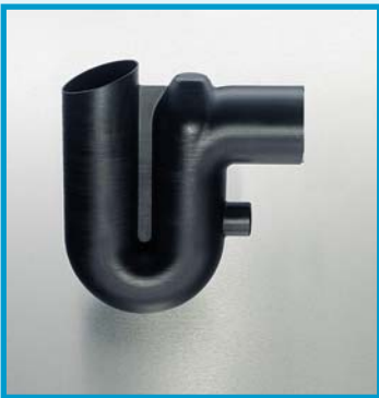
3P Overflow Siphon DN100-Without Rodent Barrier Art No. 4000210 Basic overflow.