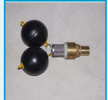
3P Giant Floating Intake Art No. Float Ball Diameter 15cm Filter Inlet sleeve mesh Check Valve - 2" Range of connections available