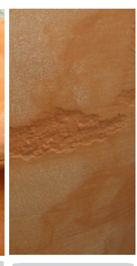
Distressed detailed finish.

3P Technik UK Tel: 01239 623506 Fax: 01239 623518 www.3ptechnikuk.com