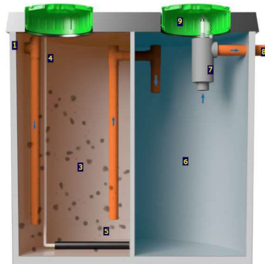
Concrete Tank Treatment Plant