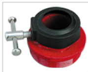
Robber boot keeps rain water and contaminants away. Available as spare: Cat. Nr. R/GNB/DN/01 Ordering Nr. 44092