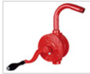
GNB-20 Pump inlet threaded 3/4" designed for use with high viscosity media