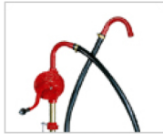
GNB-25/3R/PRO Pump with 1" inlet, complete with 1.8m hose and metal nozzle