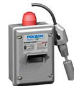
Outdoor SmartFilter® Alarm Polylok, Zabel & Best filters accept the SmartFilter® switch and alarm.