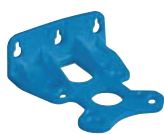
-S- wall bracket