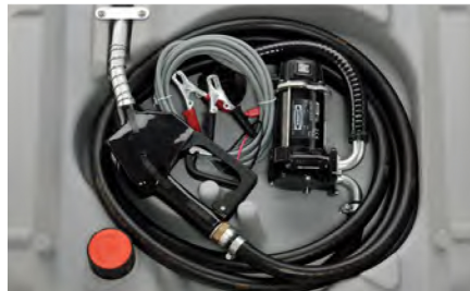
210 L with pump 12 V