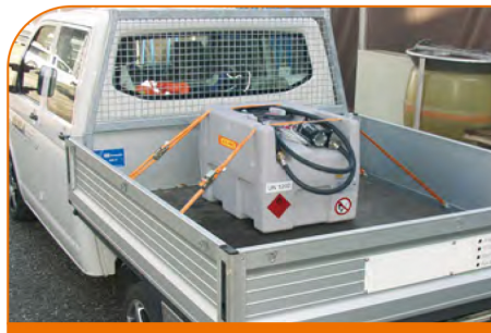
recesses for ratchet tie-down

The integral forklift pockets make handling easier when the tank is full.