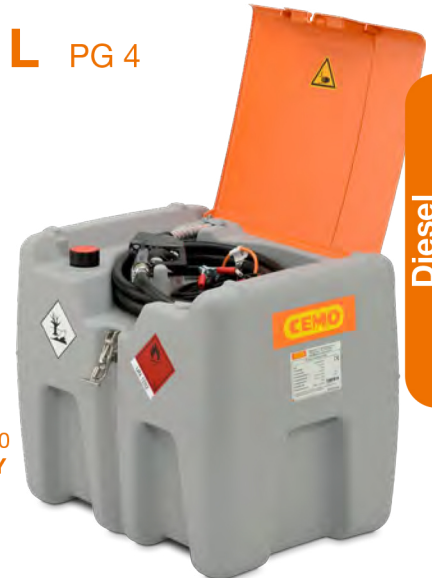
210 L with 12V submersible CENTRI SP30 12 V and hinged lid