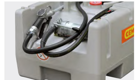
125 L with hand pump