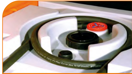
built-in hose brackets

The built-in hose brackets keep things tidy until you next need to fill up.