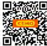
Video DT-Mobil EASY

The built-in carry handles enable the equipment to be handled easily during loading.