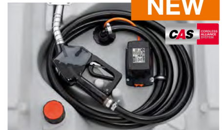
210 L with CENTRI SP30 18 V and CAS battery