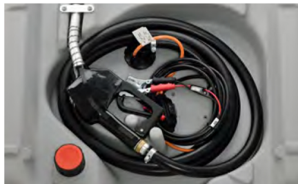
210 L with CENTRI SP30 12 V and CAS battery