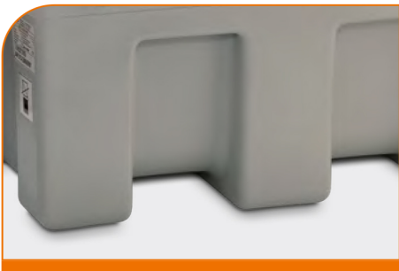
integral forklift pockets

The isolation valve enables the container to be sealed off completely, thus adding to safety during transportation (125 L, 200 L, 460 L, 600 L, 850/100 L and 980 L).