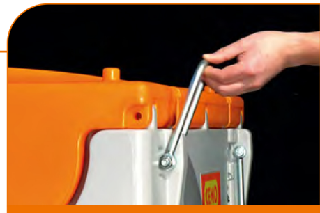
folding crane eye and lashing eyes

Integral recesses (125 L, 200 L 210 L and 440 L) and lashing eyes (460 L, 600 L, 850 L/ 100 L and 980 L) to allow immobilisation with a ratchet lashing strap during transportation.