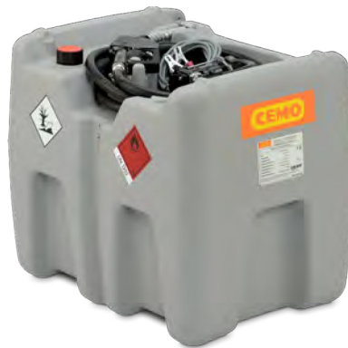
210 L with pump 12 V