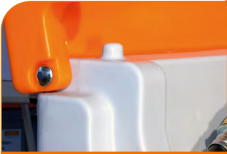
adjustable lid mount

The built-in hose brackets keep things tidy until you next need to fill up.