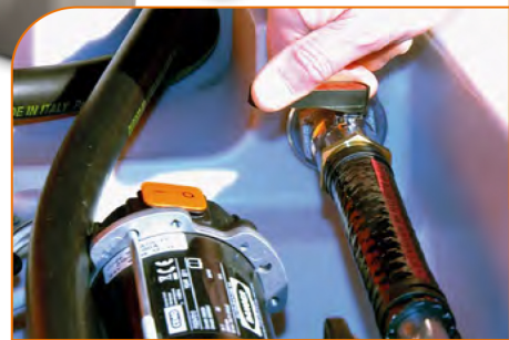
dispensing hose can be isolated

The isolation valve enables the container to be sealed off completely, thus adding to safety during transportation (125 L, 200 L, 460 L, 600 L, 850/100 L and 980 L).