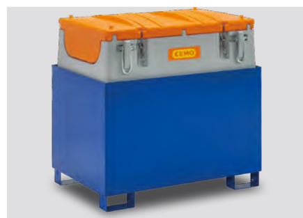
See catalogue page 153 for suitable steel bund SW 600/2