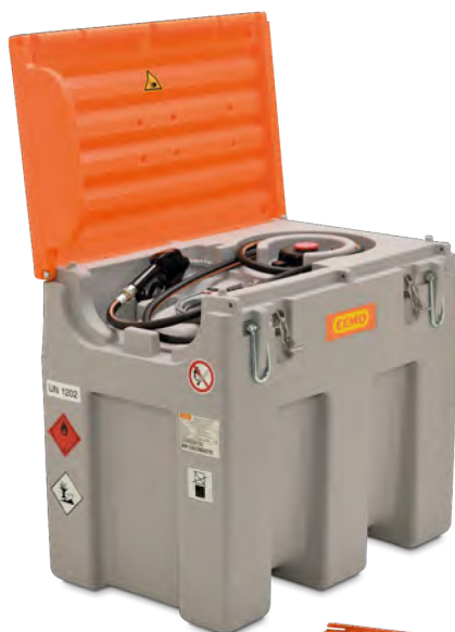
DT-Mobil EASY 600 L with electric pump, automatic nozzle and hinged lid