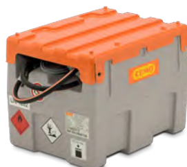
DT-Mobil EASY 200 L with electric pump, automatic nozzle and hinged lid