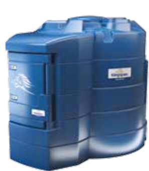
MODEL: 5000 Ltrs Capacity 5000 Ltrs / 1100 Gals Length 2850 mm Width 2250 mm Height 2350 mm