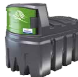
MODEL: 2500 Ltrs

Capacity 1300 Ltrs/ 285 Gals Length 1920 mm Width 1230 mm Height 1785mm