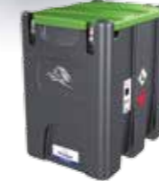
TM 300 Capacity 300 Ltrs Length 600 mm Width 800 mm Height 890 mm