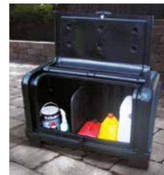
CODE: MAXISTORE BK