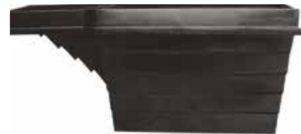
SHEEP DIP TUB