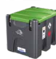
TM 200 Capacity 200 Ltrs Length 600 mm Width 800 mm Height 620 mm