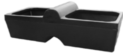
30GAL DRINKER CODE: AD02