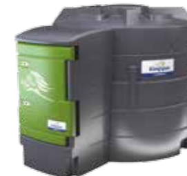
MODEL: 3500 Ltrs

Capacity 2500 Ltrs/ 550 Gals Length 2460 mm Width 1460 mm Height 1860 mm