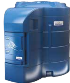
MODEL: 9000 Ltrs Capacity 9000 Ltrs / 1980 Gals Length 3280 mm Width 2450 mm Height 2950 mm