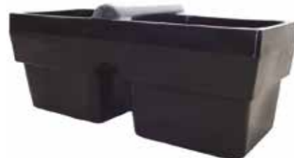
90GAL DRINKER CODE: AD03