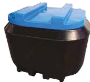
MEAL BIN CODE: AD83