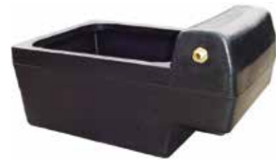
12GAL DRINKER CODE: AD01

The Kingspan range of tough cattle drinkers represents the best products of their kind available in the market. Simple and economical, these cattle drinkers come in a wide variety of sizes.