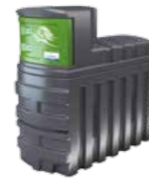
MODEL: 1225 Ltrs

Capacity 1225 Ltrs/ 270 Gals Length 2050 mm Width 900 mm Height 1970 mm