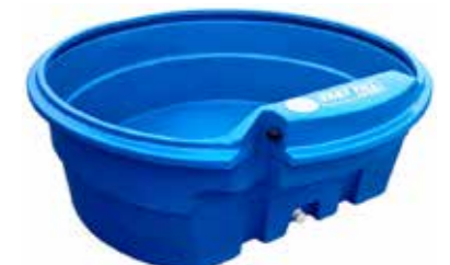
400GAL DRINKER CODE: AD95