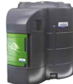
MODEL: 9000 Ltrs

Capacity 5000 Ltrs/ 1100 Gals Length 2850 mm Width 2250 mm Height 2350 mm