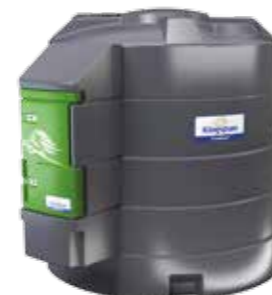
MODEL: 5000 Ltrs

Capacity 3500 Ltrs/ 755 Gals Length 2850 mm Width 2200 mm Height 1960 mm