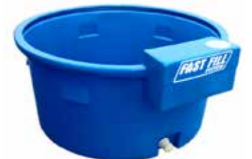
170GAL DRINKER CODE: AD93