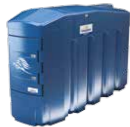
MODEL: 4000 Ltrs Capacity 4000 Ltrs / 880 Gals Length 3900 mm Width 1150 mm Height 2340 mm