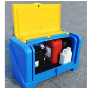
CODE: CHEMICAL STORE AD96