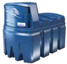
MODEL: 2500 Ltrs Capacity 2500 Ltrs / 550 Gals Length 2460 mm Width 1460 mm Height 1860 mm