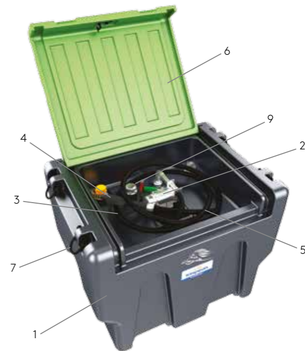
TruckMaster® 430 L