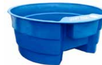
250GAL DRINKER CODE: AD094