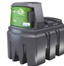
MODEL: 1300 Ltrs

Capacity 1225 Ltrs/ 270 Gals Length 2050 mm Width 900 mm Height 1970 mm