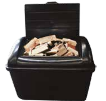
CODE: LOGSTORE AD62BK