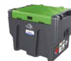
TM 430 Capacity 430 Ltrs Length 1180 mm Width 860 mm Height 910 mm