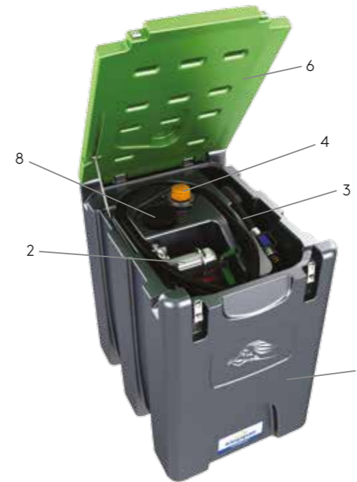
TruckMaster® 300 L