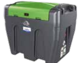
TM 900 Capacity 900 Ltrs Length 1410 mm Width 1050 mm Height 1210 mm