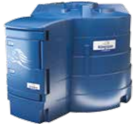
MODEL: 3500 Ltrs Capacity 3500 Ltrs / 755 Gals Length 2800 mm Width 2180 mm Height 1945 mm