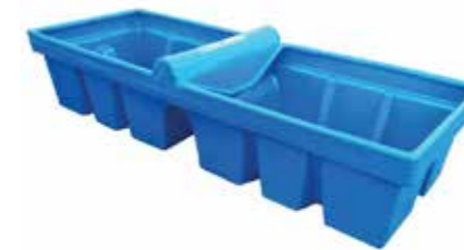
120GAL DRINKER CODE: AD92