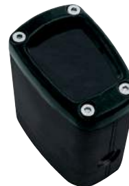
K200 HP PULSER