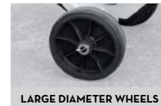
LARGE DIAMETER WHEELS