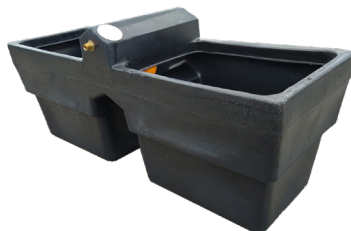
40G DRINKER AD27