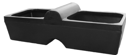
30G DRINKER AD02