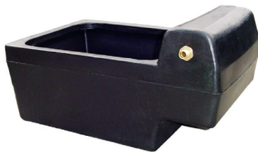
12G DRINKER AD01