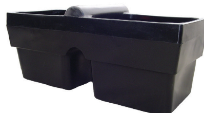
90G DRINKER AD03