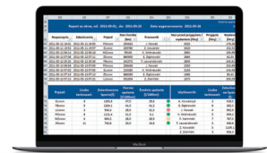
Kingspan Connect Dashboard sample

****Watchman Access is for customer's own use and not suitable for resale as is not 'weights & measures' approved.