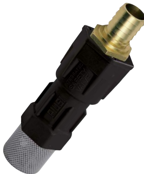
FOOT VALVE WITH FILTER