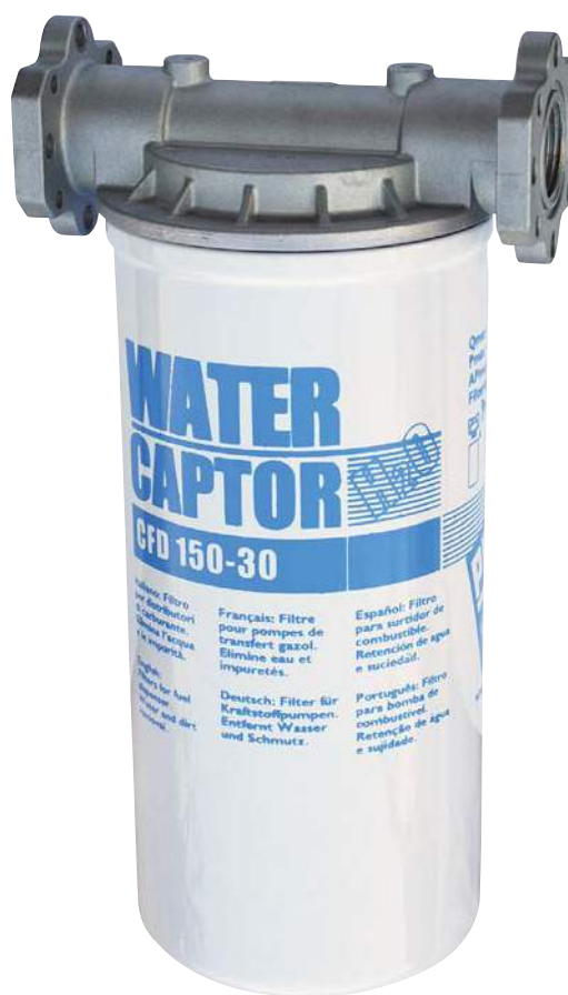
WATER CAPTOR 150 L/MIN