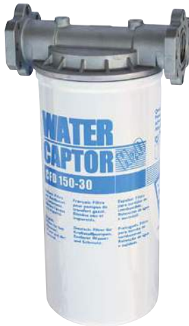
150 L/MIN WATER CAPTOR WITH WATER ABSORPTION