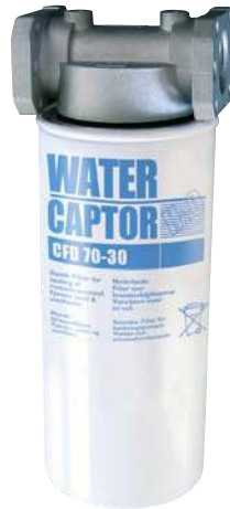
70 L/MIN WATER CAPTOR WITH WATER ABSORPTION