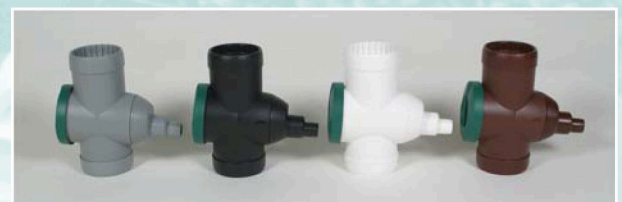
Available in Grey, Black, White & Brown