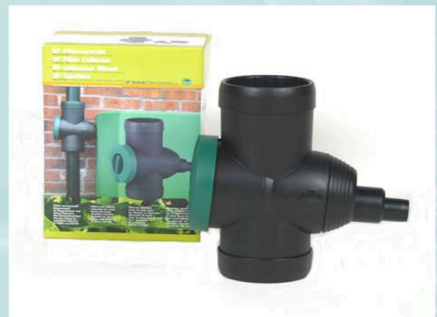
Filter Collector arrives in a retail box