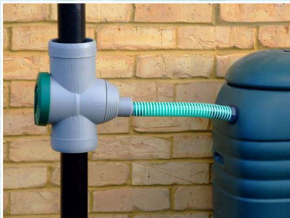
The Filter Collector with Universal Link Kit. Art No. 2000840U