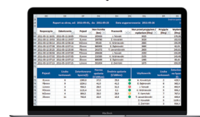
Kingspan Connect Dashboard sample

****Watchman Access is for customer's own use and not suitable for resale as is not 'weights & measures' approved.